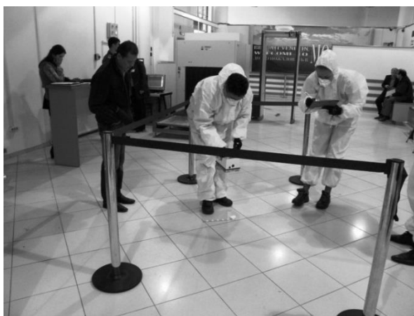
Fig. 4 Domestic Table Top Exercise

abroad has paid on the recent decade, because of the availability of transit routes in combination with non-controlled border segment controlled by Transnistrian authorities. The relevant programs have been performed (Fig. 4-7) in Moldova mainly of international assistance from the IAEA, European Commission, US DoE, US NRC and Sweden STRALSAKERHETSMYNDIGHETEN