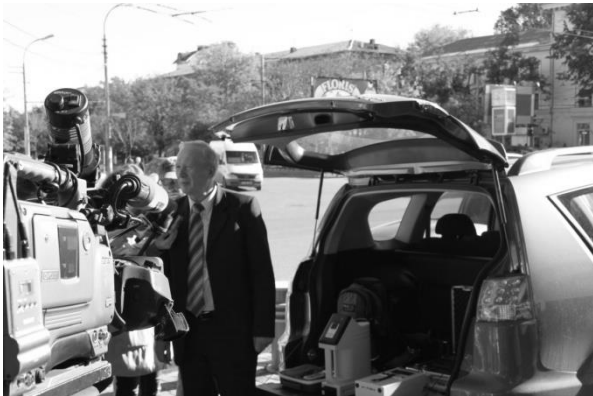
Fig. 7 Mobile Laboratory. SSM donation

To have a more fully picture of these we underline, that we activate in these fields according to established partnership through followings Action Plans or Program/Projects between: