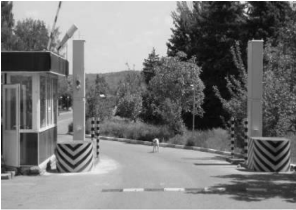
Fig. 5 Leuseni/Albitsa EU Border Crossing