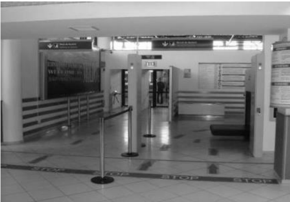
Fig. 6 Pedestrian RPM for Chisinau Int. Airport