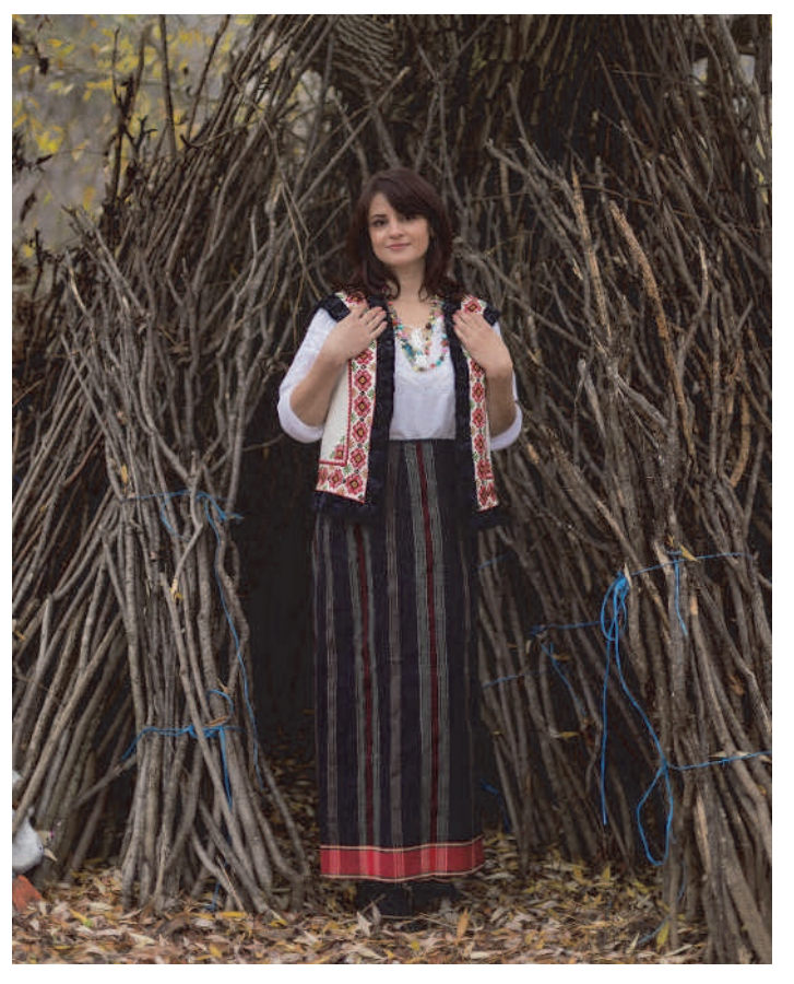
Figure 3. Skirt type "catrinta" consisting of an element