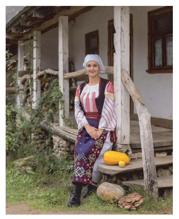
Figure 4. Skirt type "fota" consists of two elements