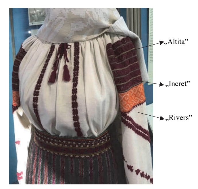
Figure 1. Shirt with "altita", National Museum of Ethnography and Natural History, Chisinau

The rethinking and modification of "altita " were correlated with the requirements imposed on their aesthetic solution. The ornamental motif inscribed on the "altita " – considered sacred – is not repeated anywhere else on the shirt, for example, the "rivers on the sleeve" on the face, or the back of the shirt, are easily repeated" [3, 5, pp. 53-54].