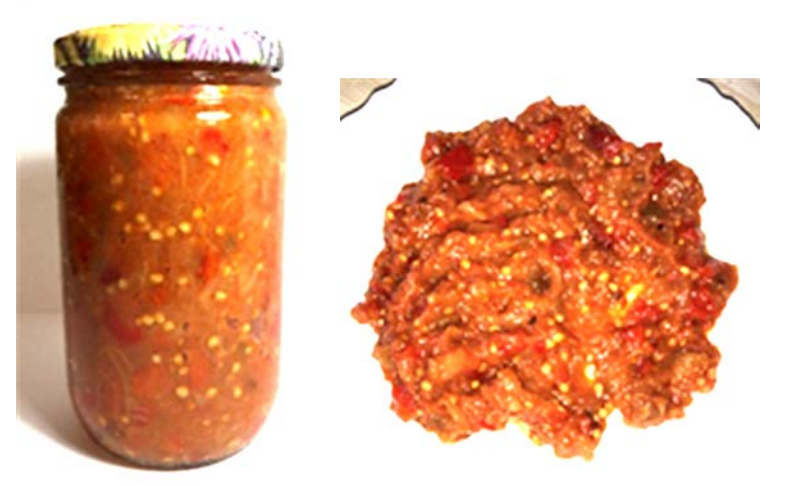
Figure 5. Image of the experimental sample vegetable stew of type "Zacusca".

Following the sensory evaluation (Table 4) it was concluded that all 5 analyzed indicators presented very good results. The products did not present any objections from the tasting committee and were appreciated with maximum points. At the same time, for a more complex understanding, in figure 5 are presented the photos of the exterior aspect of the elaborated product.