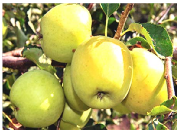
Figure 1. Image of apple fruits of the Golden Rezistent variety [9].

Golden Rezistent is a variety obtained in SUA. It is considered a kind of perspective. The trees are demanding to the soil, have high winter hardiness and secetă. It has stable scab resistance and high resistance to powdery mildew. The fruit is of medium to large size with a mass of 150-160 g, it has a conical-oblong to conical-truncated shape and a smooth surface. Colour of apple is yellow and of pulp is white-cremy. It bears fruit in abundance early and the flowering season is medium. Requires the thinning. The variety is authorized for all areas of the Republic of Moldova [9].