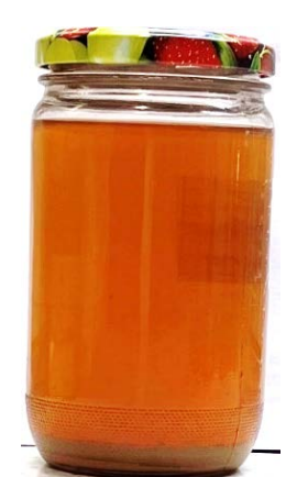
Figure 3. Image of the experimental sample of acidifier from unripe apples Golden Rezistent variety.

The acidifier from unripe apples Golden Rezistent variety harvested in 2019 on the 71<sup>st</sup> DAFB was obtained and can be seen in Figure 3. It was later analyzed physicochemically and sensorially in order to be applied to the production of vegetable stew type "Zacusca".