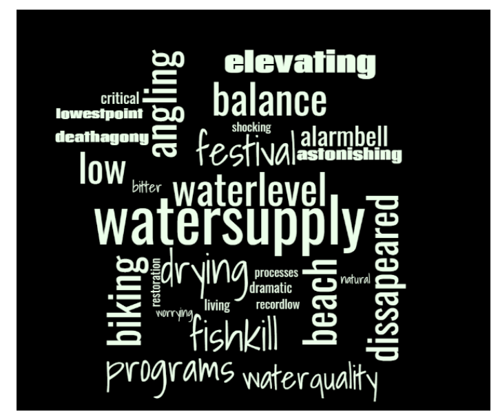
Figure 2. Word cloud based on the analysis of the first 150 results for the query "Velenceitó": "water supply" is the most common expression.

Media coverage and public reactions to the previously detailed processes describe and complete the picture regarding the entire phenomenon, while also influencing tourist demand. Based on a Google search made in January 2023 (query "Velencei-tó" = Lake Velence in Hungarian), the summary of keywords in the first 150 articles/webpages within the results shows that public opinion is singularly focused on how/when the previous, artificially created system, which is difficult to maintain, can be restored. As the artificially high water levels have become familiar and seemed manageable during the decades since the lake regulation took place, local residents, stakeholders, local and national policymakers are practically only debating different alternative ways of increasing water supply (by redirecting karst water, drinking water, purified waste water, restoring water supply infrastructure etc.), adaptation to water level fluctuation and temporarily low water levels has not been widely considered. Another easily identifiable trend among the search results is the abundance of emotionally charged, strongly negative expressions ("dramatic", "critical" etc.), which shows that the natural behaviour of the lake is unanimously seen by people as a serious problem, while the naturalness and ecological benefits of low water levels are barely known (Figure 2).