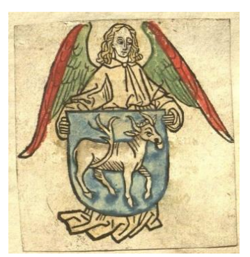
Figure 2. The bookplate of Hildebrand Branderburg, the 15<sup>th</sup> century, from the archives of Farber University [9]

The oldest ex-libris that came in the form of a paper tag is the German 1470 ex-libris, belonging to the monk Hildebrand Branderburg (fig. 2). It was printed with black ink using woodcut technology. This technique involves carving out the design from a block of soft wood and pressing the ink-covered wood on paper to create an image. Afterwards the bookplate (fig. 2) was colored manually. The image represents an angel holding a coat of arms with a goat. The chromatic scheme is defined by the complementary pair of red and green and the colors blue, yellow.