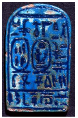
Figure 1. Egyptian bookplate, exhibited at the British Museum [6]

The oldest bookplates which indicate ownership date back to the 14<sup>th</sup> century BCE, in Egypt. They were small blue ceramic plates, used as tags for boxes with papyrus rolls. The hieroglyphs were encrusted in dark blue and stated the owner's name, and the title of the work. The bookplate of Egyptian pharaoh Amenophis III and his wife, queen Teie (fig.1) is currently exhibited at the British Museum. Their names are written inside two cartridges, this signifying their status as pharaoh [4].