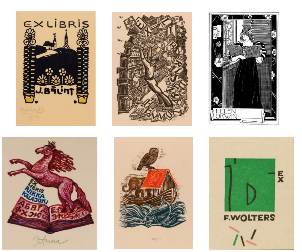
Figure 6. Bookplates exhibited at the Frederikshavn Art Museum [8]

Ex-libris started losing popularity as books became an ordinary object in most homes. Their role evolved from an indicator of prestige to an occupation reserved for graphical artists, collectors, and book enthusiasts. Throughout the 20<sup>th</sup> century, artists experimented with various styles, from colorful illustrations, intricate calligraphy to pop art and abstract representations (fig. 6). Various printing techniques like metal engraving, laser printing and even computer graphics were used.