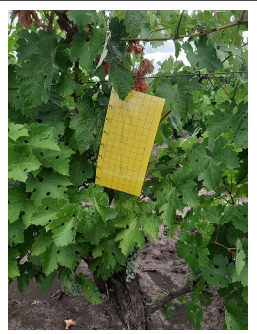
Figure 2. Fixed double-sided sticky trap.