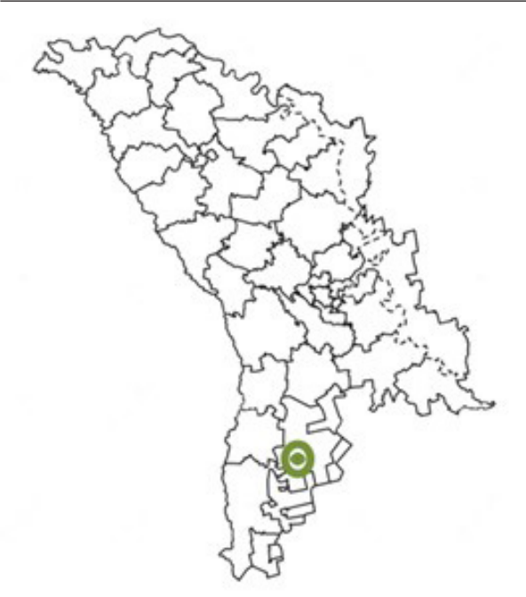
Figure 1. The location of the research point.