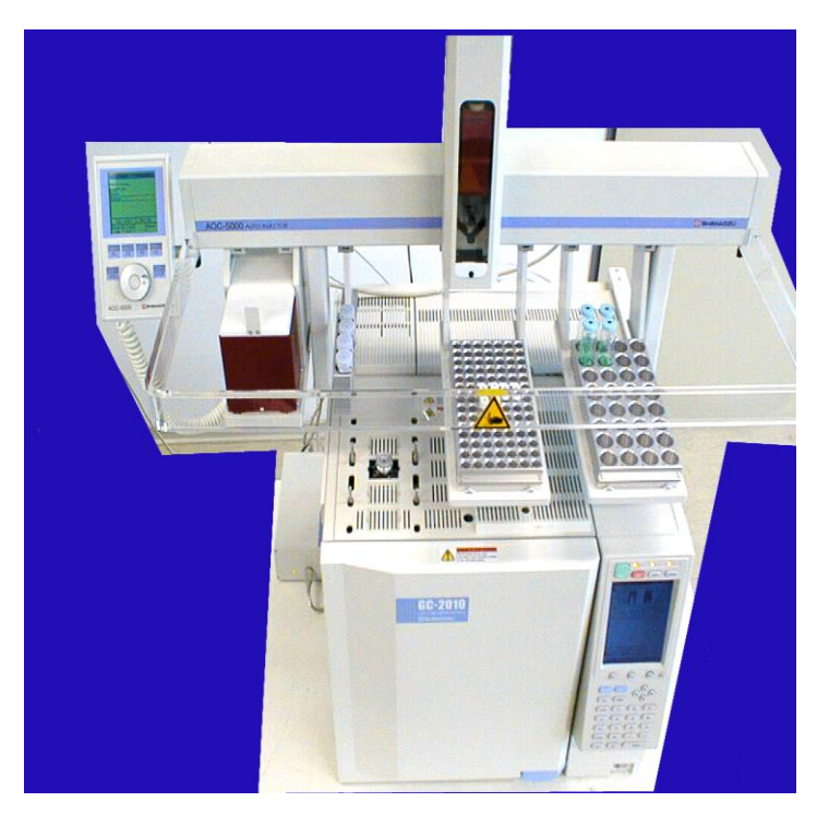
Fig. 1. GC/MS QP2010SE coupled with three-dimensional automated system for sample injection AOC-5000

Statistical analysis was conducted with three replications of the same sample.