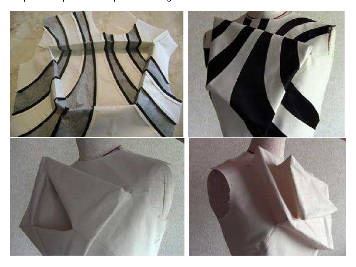
Figure 1: Use of "Architectural" technique on the façade of product

The "Architectural" technique may be applied to any element of the garments, both with shoulder support and with waist support. These elements confer additional originality that may be developed by various modalities of tracing styling lines, as well as by the use of materials of various colours. The complex architectural elements provide for the possibility to diversify the external appearance of products by chaning the position of particular components of the geometric element.