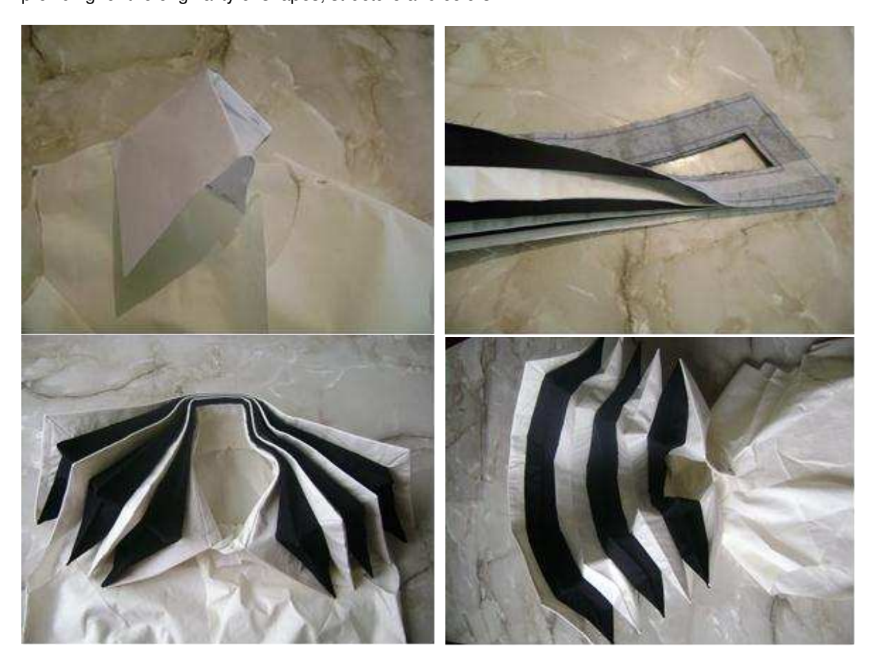
Figure 3: Use of "Accordion" technique for making a shirt-type collar

The "Accordion" reconstruction technique may be used for the spatial transformation of any product area, providing for the originality of shapes, structure and colors.