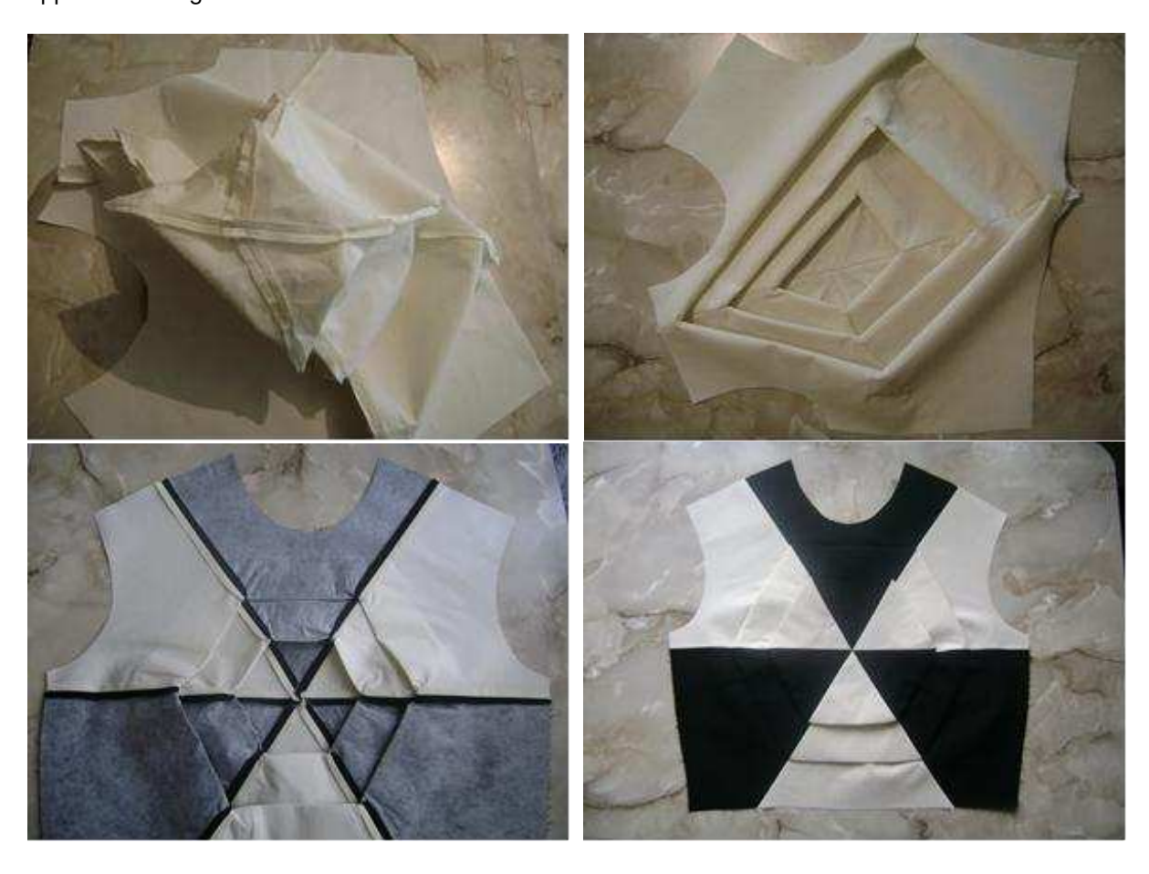
Figure 2: Application of the "Origami" technique on the façade of product

This technique provides for the possibility to arrange the three-dimensional element both inside the product and in its exterior, obtaining different visual effects, thus contributing to the diversification of the external appearance of garments.