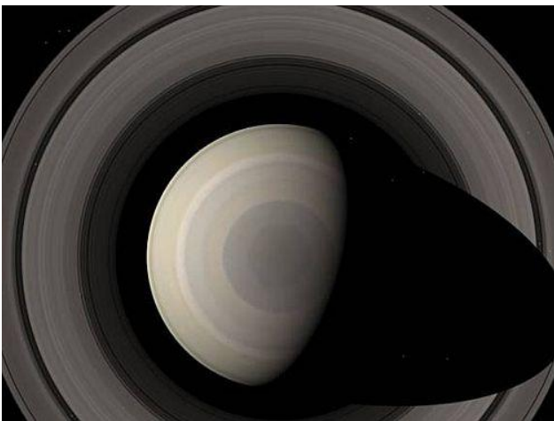
Figure 1. Photo taken by the Voyager Space Probe of the vortex motion of gaseous medium at the poles of the planet Saturn [1]

The astronomers discovered an interesting peculiarity of the phenomenon – the central part of the vortex was of hexagonal shape. It could be seen on the photographs, made by Voyager space balloon that hexagonal shape was not very much clear. (See cyclone's "eye").