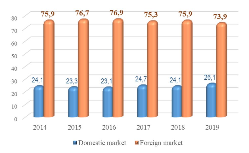
Figure 2. The structure of apparel markets, in %.

Over 70% of the total value of the manufactured industrial production in the Republic of Moldova is export-oriented, as presented in the figure no. 2.