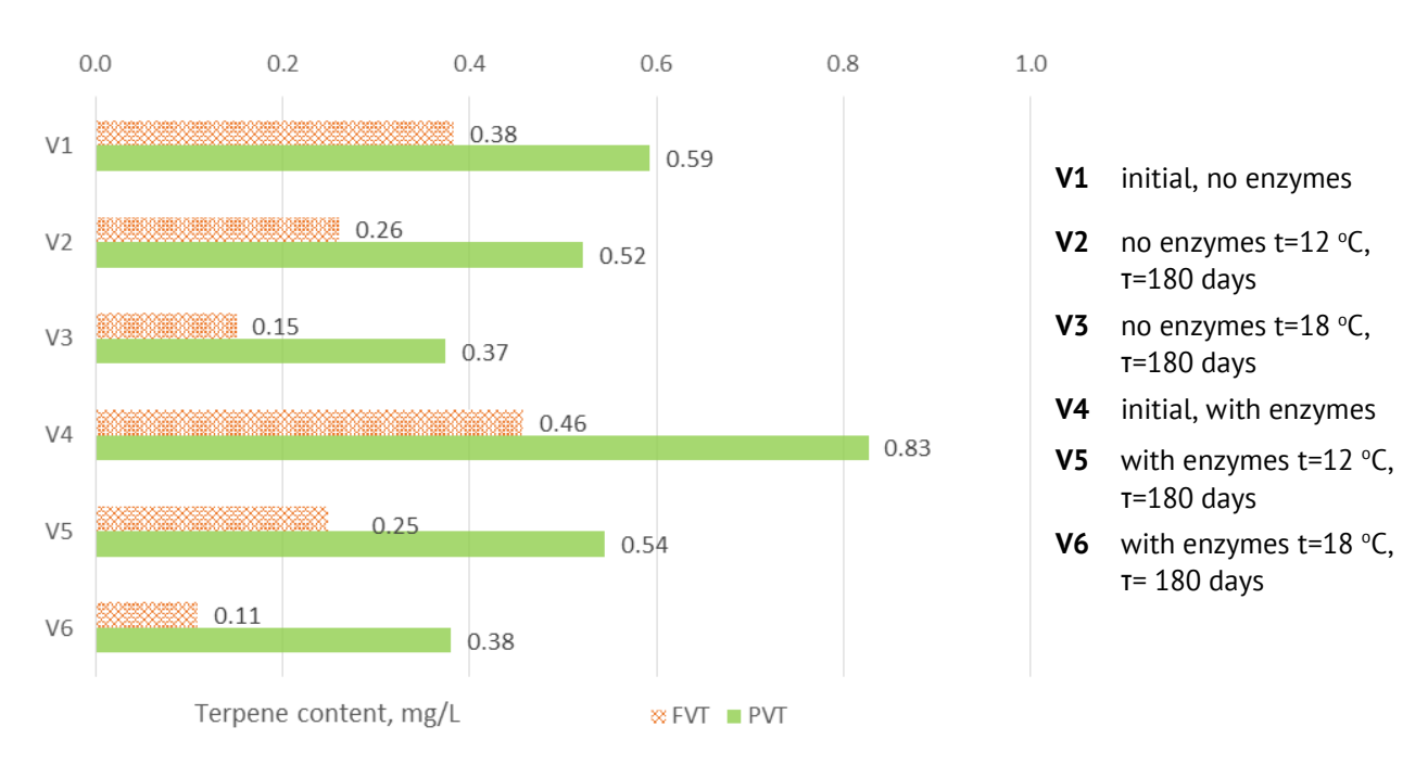
Figure 2. Variation of terpene compounds during storage at different temperatures.

Wines are constantly evolving, so a special interest is the dynamics of terpenes during the wine storage [26]. For this purpose, the wines obtained with or without the addition of enzymes at the maceration and stored 6 months at 12 °C and 18 °C were analyzed by spectrophotometrical method. The variation of terpene compounds after six months of storage at different temperatures is shown in Figure 4.