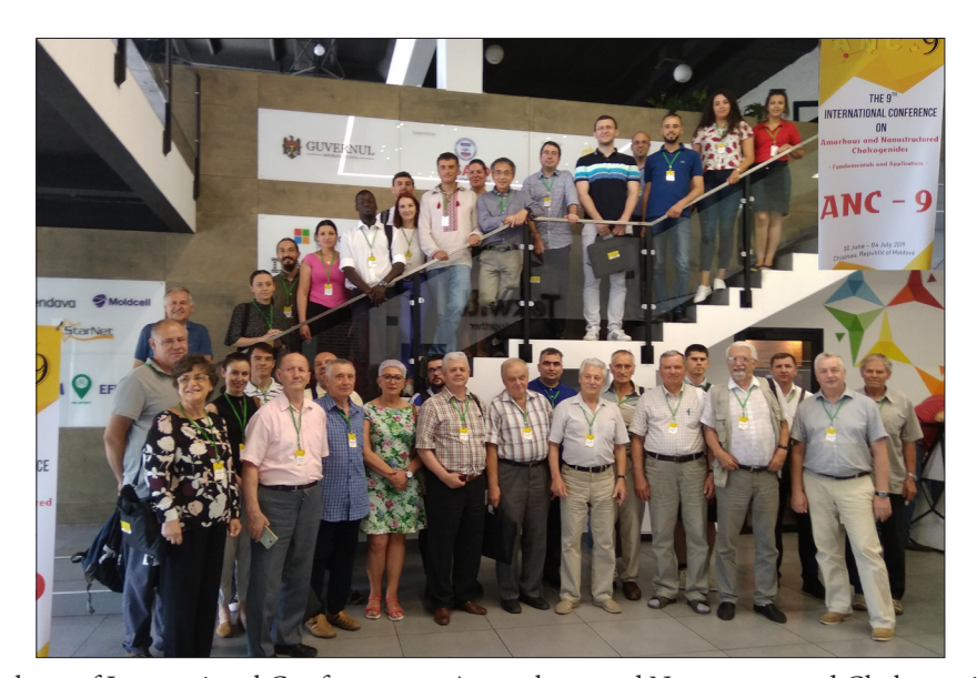
Figure 7. Group photo of International Conference on Amorphous and Nanostructured Chalcogenides, ANC-9, dedicated to the 85 anniversary of the Academician Andrei Andriesh. Chisinau, 1 July 2019.